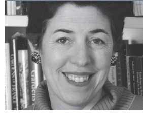
ANN M. BEHA

Based in Boston, Ann Beha's 30 year practice encompasses museums, civic buildings, libraries and buildings for education and the performing arts. In all, it is the centrality of the historic landmark and its coupling with contemporary design expression which so distinguishes the work. Ann's current projects include building revitalization and new design at the University of Chicago, Cornell Law School, The New England Conservatory of Music, and Wellesley College. Her completed projects include buildings at Penn, Princeton, the Portland Museum of Art in Oregon, and the Taft Museum in Cincinnati. She received the Lifetime Achievement Award from the New England Chapter of the Victorian Society in America, a 25th Anniversary Award from the Massachusetts Historical Commission, the Women in Design Award from the Boston Society of Architects and the Alumnae Achievement award from Wellesley College. Ann is a graduate of Wellesley, holds a Master of Architecture Degree from the Massachusetts Institute of Technology, and was a Loeb Fellow at the Graduate School of Design at Harvard University. In 2011 Architect Magazine ranked AnnBeha Architects in the Top Five firms in the United States, the only firm known for the revitalization of historic resources named at that level. Ann Beha will be teaching as a distinguished Visiting Professor in the spring of 2012 semester at the Bernard and Anne Spitzer School of Architecture.