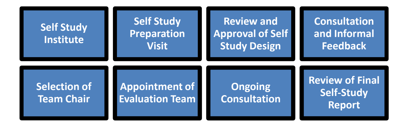
FIGURE 3: POINTS OF CONTACT BETWEEN INSTITUTIONS AND COMMISSION STAFF