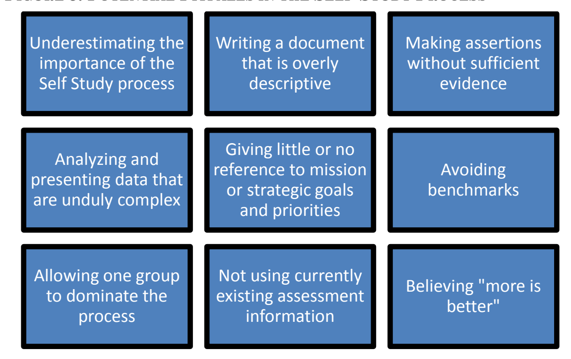
FIGURE 5: POTENTIAL PITFALLS IN THE SELF-STUDY PROCESS